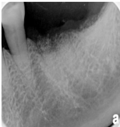
Grafted site – Feb. 2015