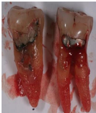
Extraction – Dec. 2014