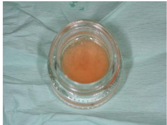
PRF with dentin graft