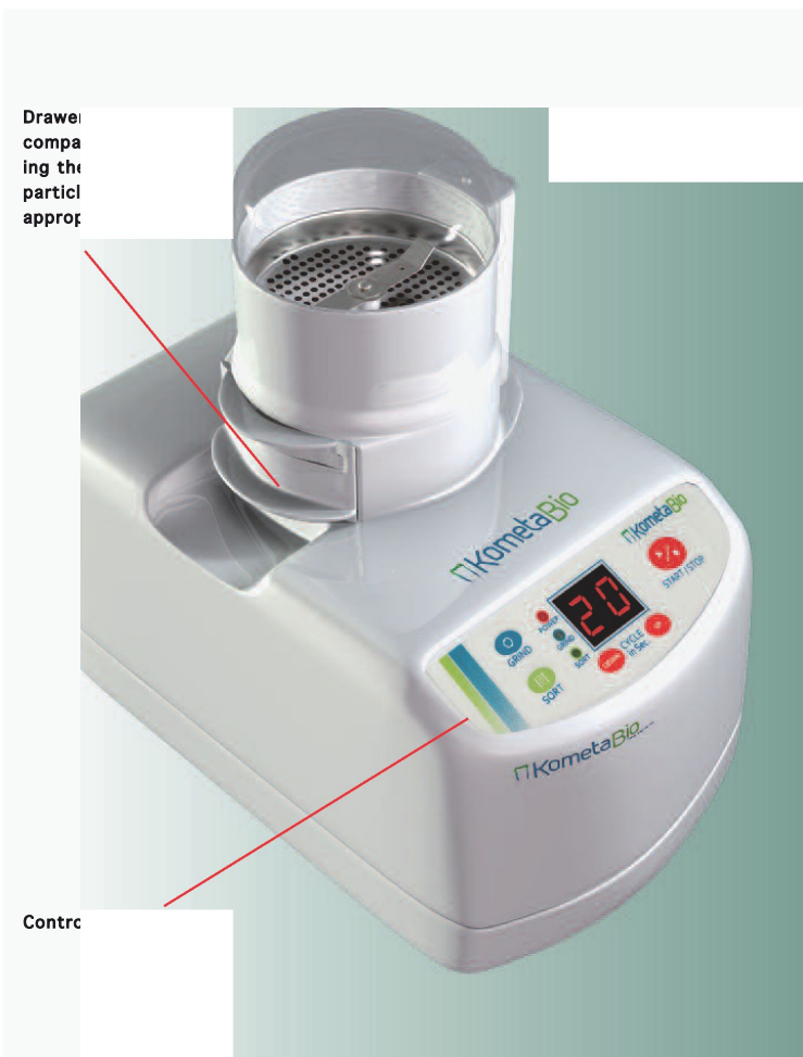
Smart Dentin Grinder: Tooth grinding and dentin particulate sorting system. The 250 to 1200 \mu m particles are collected in the drawer and then decontaminated before being re-implanted in the tooth socket for an autologous graft.